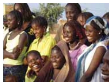
During pupils theatre