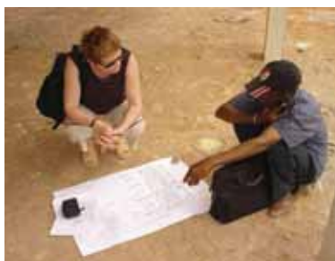
On the building site

In 2009, we will have to start the first maintenance actions. The buildings will be in use for five years already. There are many users and even if everyone is careful works like painting maintenance and general maintenance are necessary.