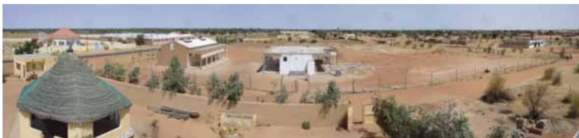
First two buildings of the school from the roof of the centre Morgane

The third building includes two class rooms and toilets. The funds are not complete yet but we decided to start the building while we were in Dagana. We hope that the financial support we are waiting for and the help from everywhere else is coming soon.