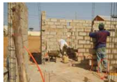
Building site - March 2008

association.morgane@numericable.fr www.association-morgane.org