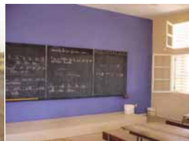
The blue class

Thank you : the ambition of our association is large and you are all part of it. Our hope for the following years is to start the building of a preschool for the end of 2008 in order to open two classes for the scholar year 2009... with rhythm and continuity. Thanks for joining us.