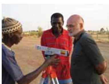
Discovery of laser level