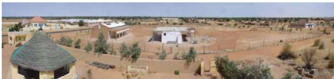
First two buildings of the school from the roof of the centre Morgane

The third building includes two class rooms and toilets. The funds are not complete yet but we decided to start the building while we were in Dagana. We hope that the financial support we are waiting for and the help from everywhere else is coming soon.