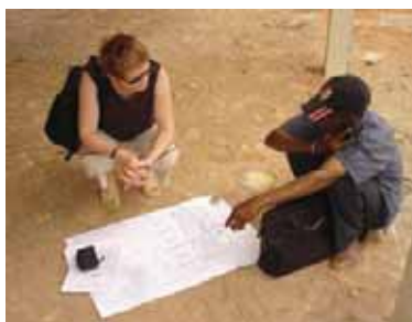
On the building site

In 2009, we will have to start the first maintenance actions. The buildings will be in use for five years already. There are many users and even if everyone is careful works like painting maintenance and general maintenance are necessary.