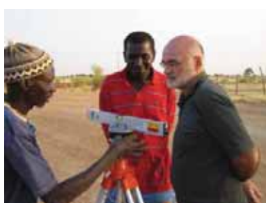
Discovery of laser level