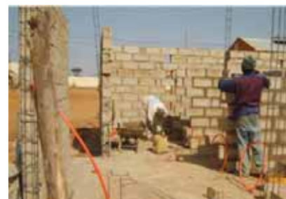
Building site - March 2008

association.morgane@numericable.fr www.association-morgane.org